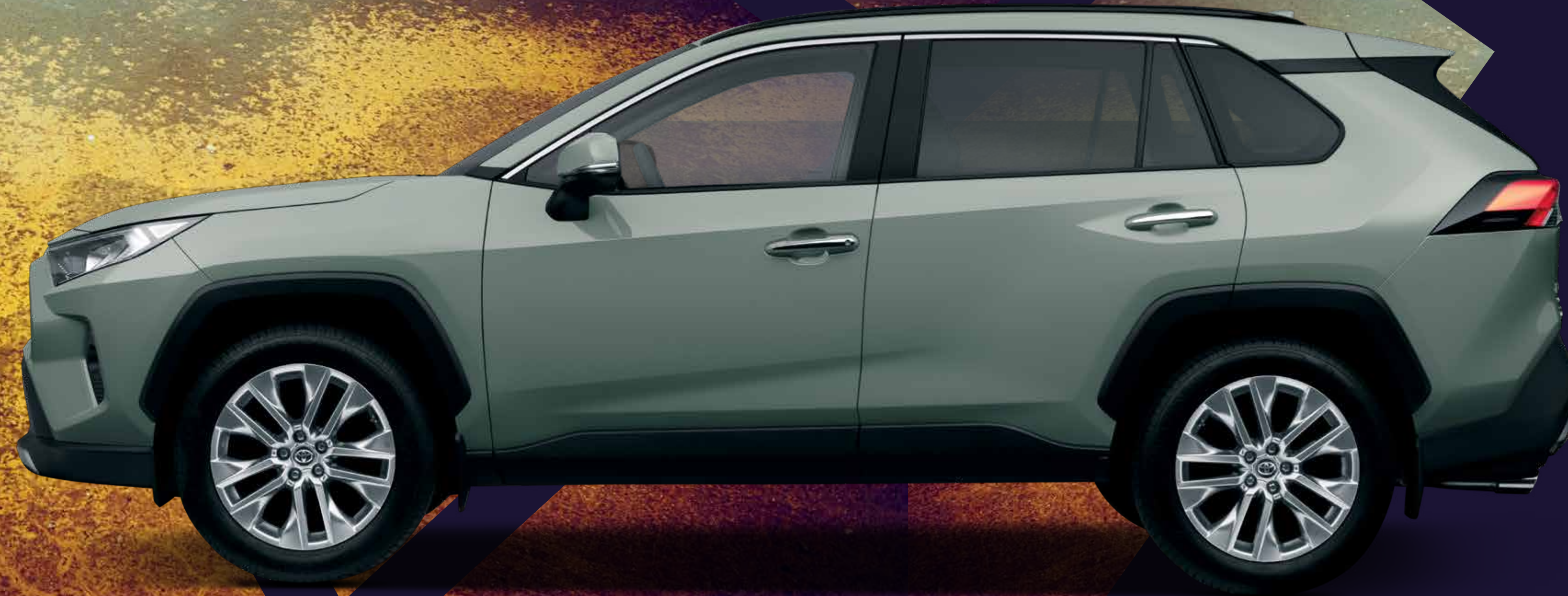
MODEL SHOWN 2.5 VX AT AWD