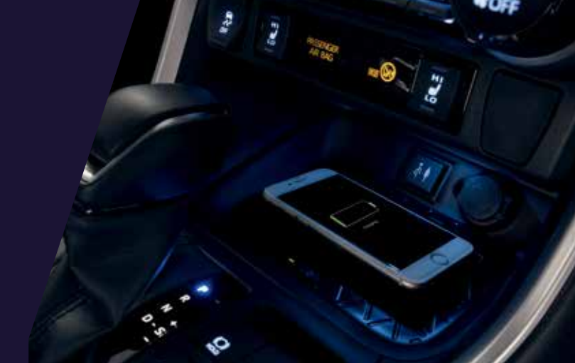
INTERIOR SHOWN 2.5 VX AT AWD

To keep you connected and powered up, the RAV4 now features a conveniently located wireless charging mat for compatible handheld devices.