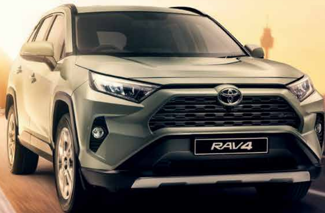
MODEL SHOWN 2.5 VX AT AWD