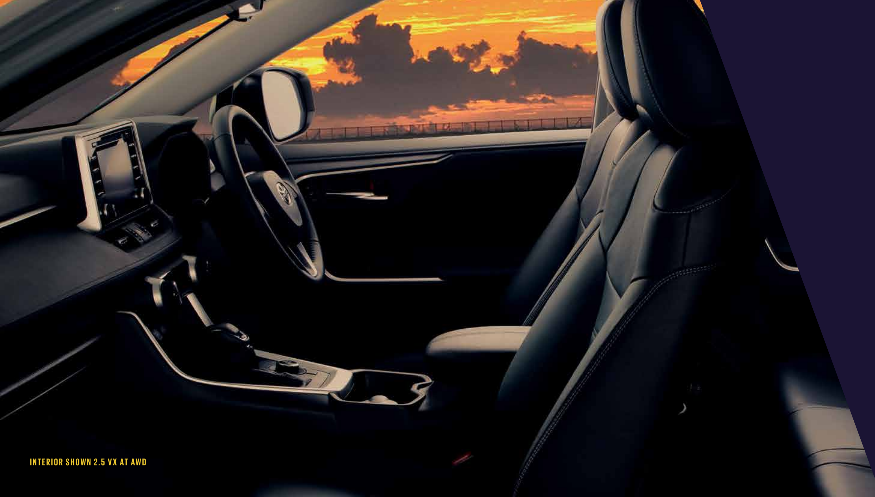
INTERIOR SHOWN 2.5 VX AT AWD