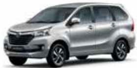
Quicksilver Metallic 1E7