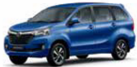
Cosmic Blue 8X2