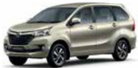
Gold Leaf Metallic T23