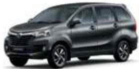
Graphite Grey Metallic 1G3