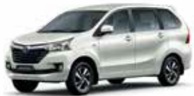
Tusk White W09