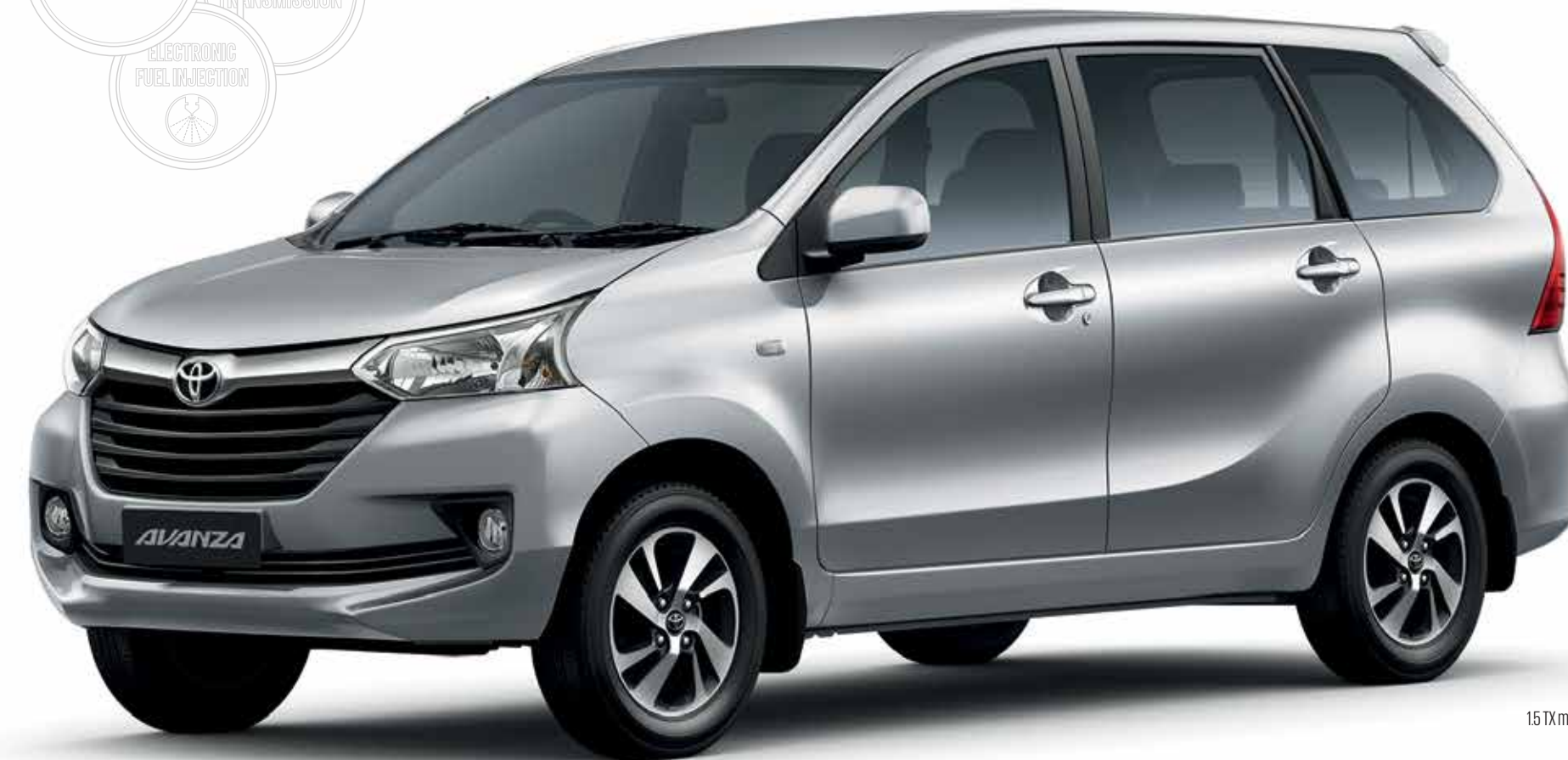
1.5 TX model shown

The Avanza has all the performance and power you need to keep your family and your business on the move. The 1.3 litre engine has 71 kW of power at 6000 r/min and delivers torque of 121 Nm at 4200 r/min, while the 1.5 litre has 77 kW of power at 6000 r/min and delivers torque of 136 Nm at 4200 r/min. Also integrated into the 1.5 litre SX is the Avanza automatic transmission, which makes driving in