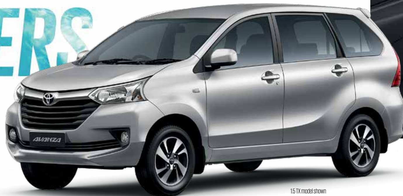
1.5 TX model shown

Running families and businesses requires plenty of time on the road, running between points A and B and sometimes to what seems like point Z. The Avanza was specifically designed to take everyone's safety into account.